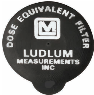
Ambient Dose Filter